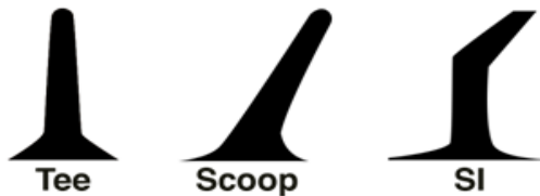
H - Cleat Styles

Special Instructions: _____ _____ _____ _____